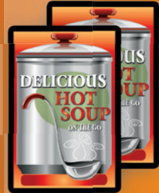
5.5X8.5 COUNTER CARDS