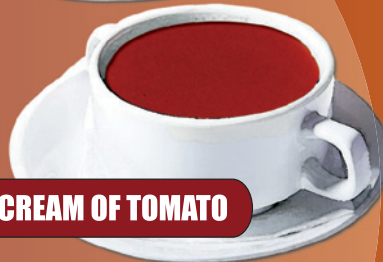
CREAM OF TOMATO