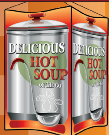
3-SIDED 11X17 CEILING DANGLERS